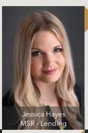
What's one tip for first time homebuyers?

"We help you through each step of the way. As a part of the credit union family, we want to help you achieve whatever your financial goals are."