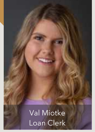
How long have vou worked at LFCU and why?

"I look forward to exploring different ways to go above and beyond to assist the members, our average day is pretty fast paced and fun!"